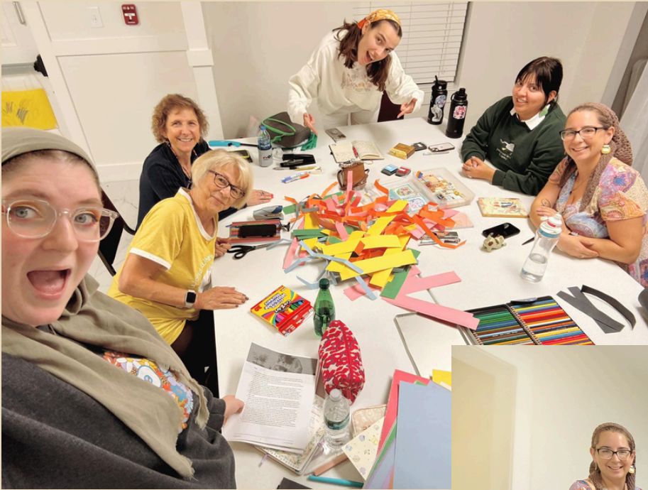
Our Rosh Chodesh Well Circle made loops for the Sukkah!